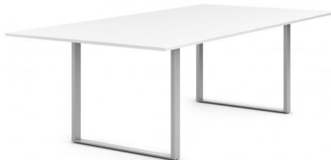
Adapta 2 Plus JG GROUP