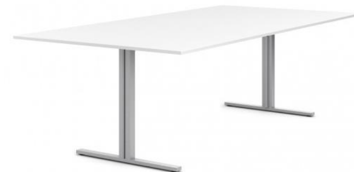
T Work JG GROUP