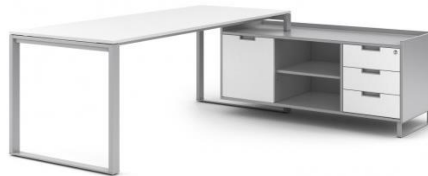
Adapta 2 Plus JG GROUP