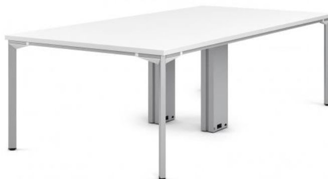
Modul JG GROUP