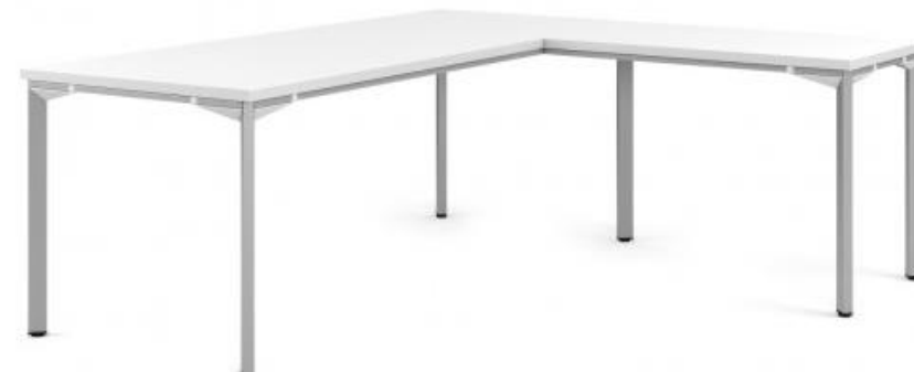
Modul JG GROUP