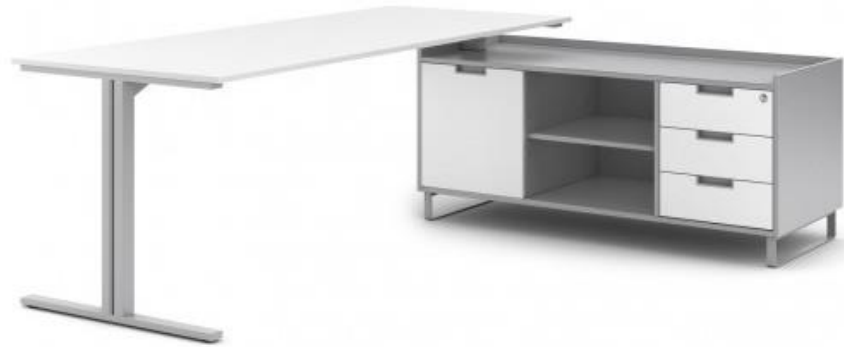
T Work JG GROUP