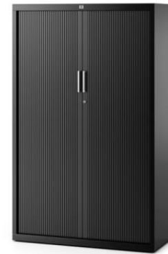
PV Plus JG GROUP