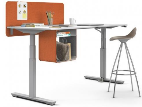
T Care JG GROUP