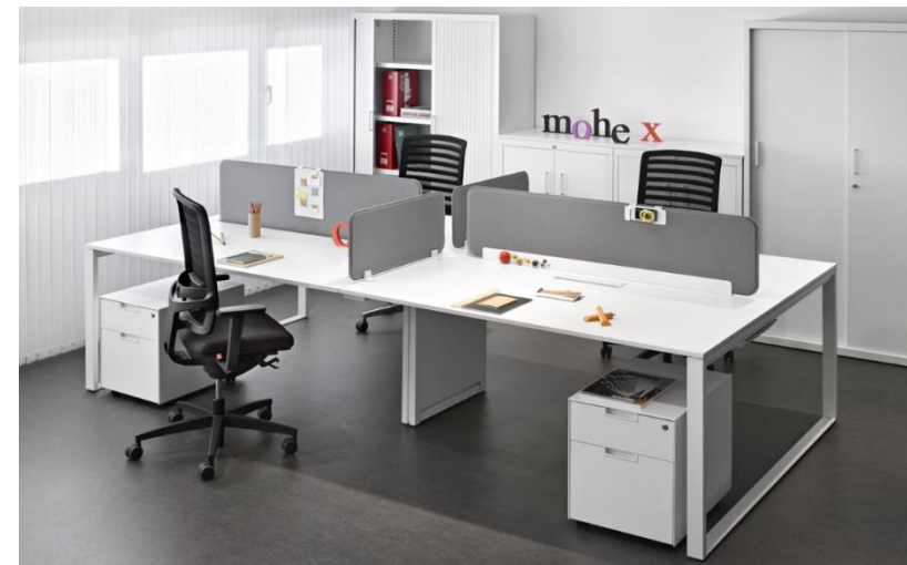
Adapta 2 Plus JG GROUP