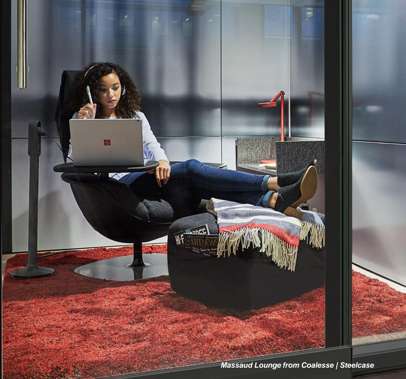
Massaud Lounge from Coalesse | Steelcase