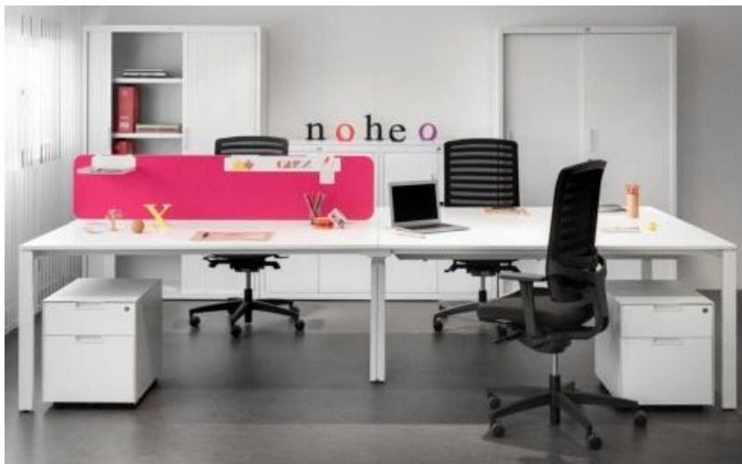
Adapta Plus JG GROUP