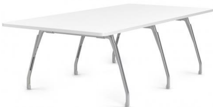
Inspira JG GROUP