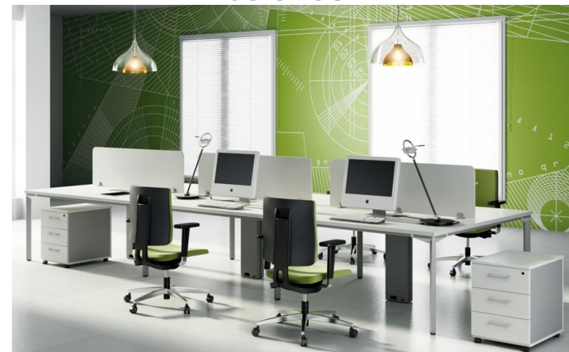
Modul JG GROUP