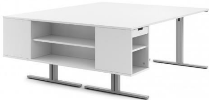
T Work Filing Solution JG GROUP