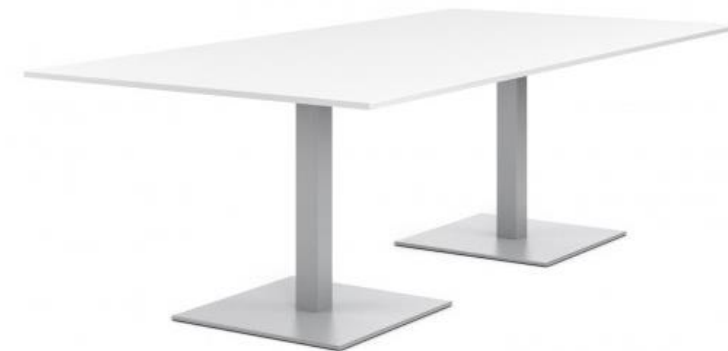
Cuadrat JG GROUP