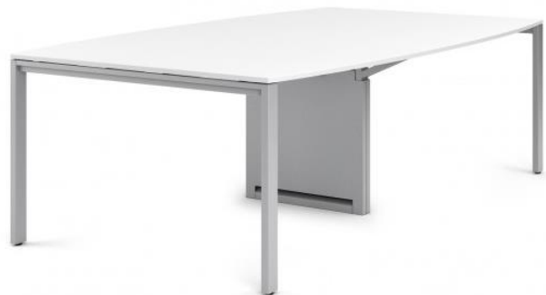
Adapta Plus JG GROUP