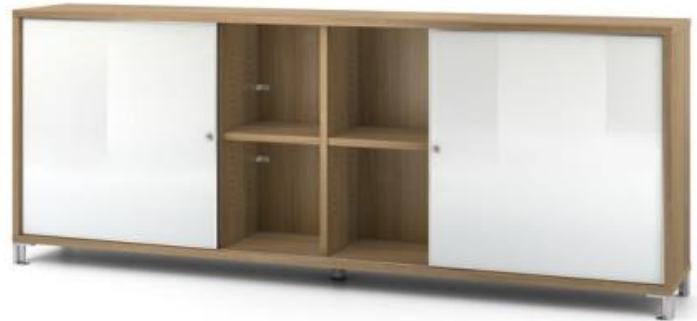
AD JG GROUP