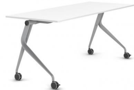
2 Move JG GROUP