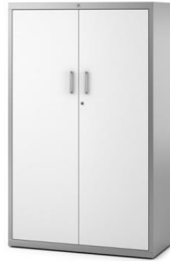
AMT JG GROUP