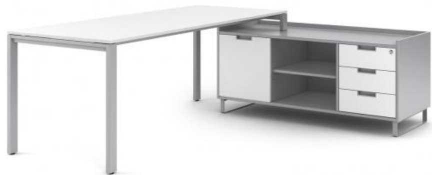
Adapta Plus JG GROUP