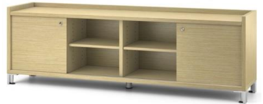
MAD JG GROUP