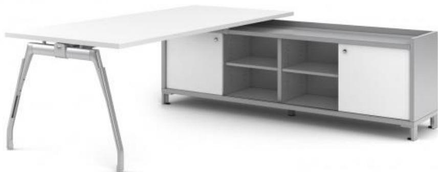
Inspira JG GROUP